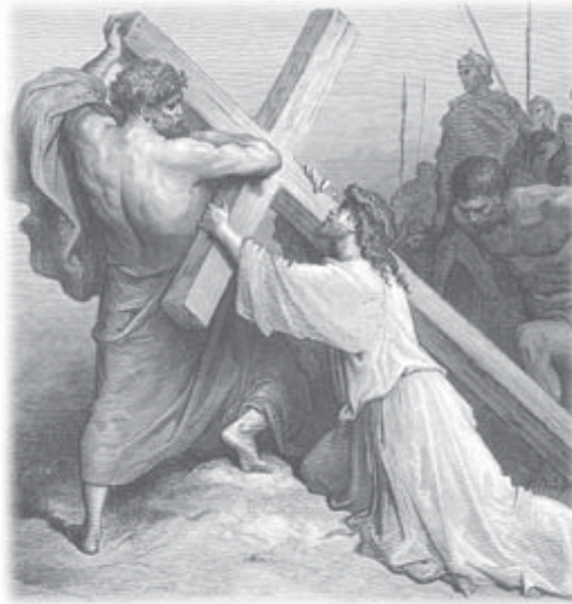
"Christ also hath once suffered for sins, the just for the unjust, that he might bring us to God..." 1 Pet. 3:18

out, when the times of refreshing shall come from the presence of the Lord... Whom the heaven must receive until the times of restitution of all things, which God hath spoken by the mouth of all his holy prophets since the world began.... him shall ye hear in all things whatsoever he shall say unto you. And it shall come to pass, that every soul which will not hear that prophet, shall be destroyed from among the people." Acts 3:19-23