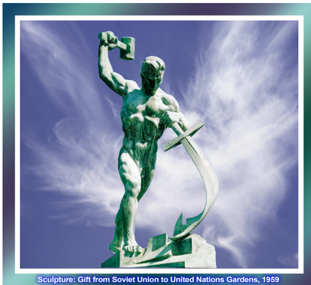
Sculpture: Gift from Soviet Union to United Nations Gardens, 1959

Indeed, these men had imagined a vain thing! God must certainly have been repulsed by their vain claim that He is on their side! What a pity that He should in any sense of the word have been associated with such horror! And now, unfortunately, religious zeal coupled with ignorance is once again terrorizing innocent people on a worldwide scale. This is an example of what happens when there is a lack of knowledge as to the loving character and plans of one true God.